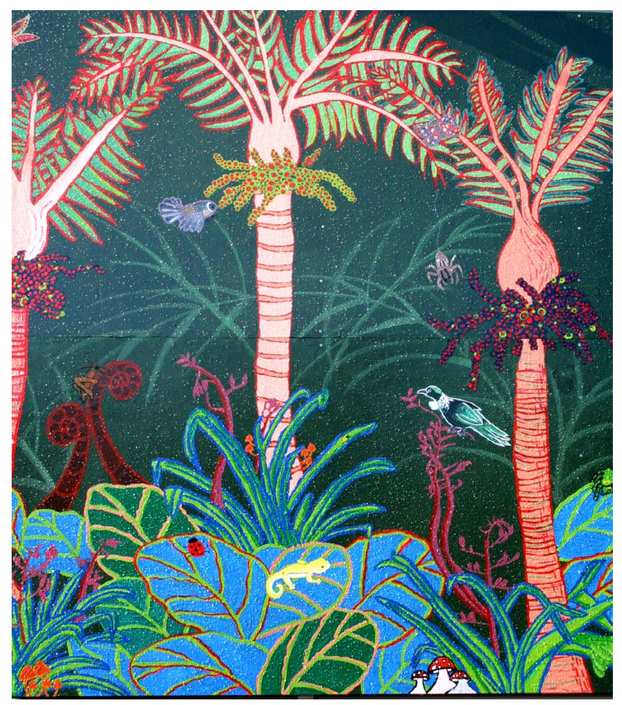
Mural painted by our Year 5 to 8 students 2006 - has pride of place on the side of our hall