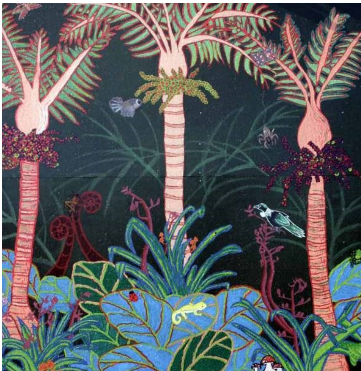
Mural painted by our Year 5 to 8 students 2006 - has pride of place on the side of our hall